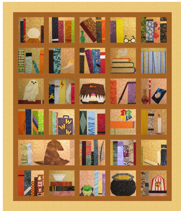
Software generated representation of Layout 2