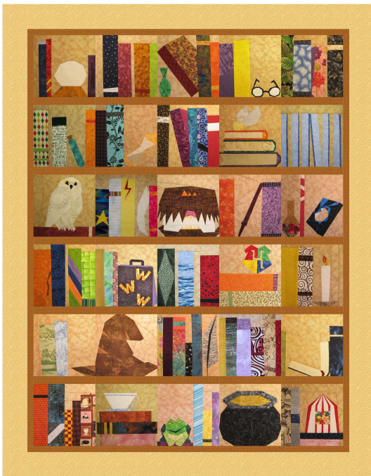
Software generated representation of Layout 1

Approximate Fabric Amounts needed to complete your Project of Doom Quilt. These are suggested instructions only. Please finish your quilt any way that pleases you.